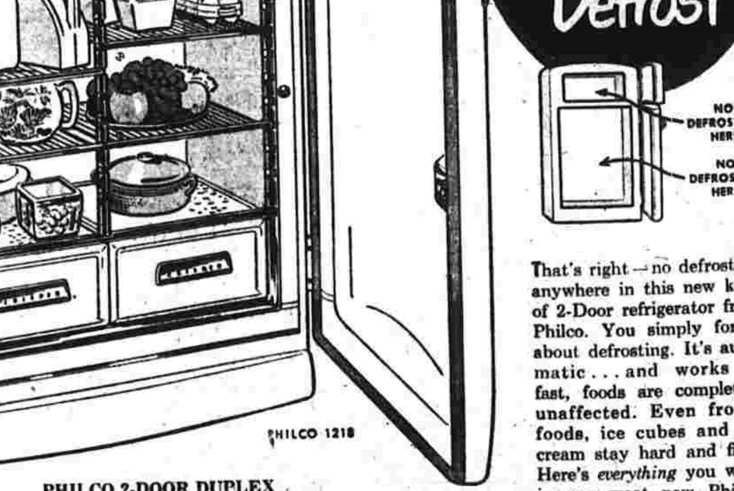
PHILCO 2-DOOR DUPLX 12, 10 and 8 Cu. Ft. from $384.95 Up

REVOLUTIONARY NEW PHILCO 2-DOOR DUPLX REFRIGERATOR ...with TRUE HONEST Automatic Defrost